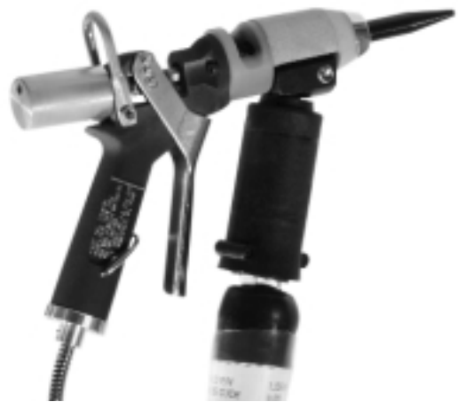
243609 Manual Hot Melt Flow Gun